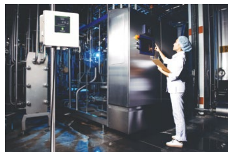
Thermal Power Plants Boiler Emissions (Not for stack monitoring)