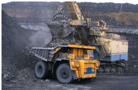
Mining Industry From extraction, including blasting and crushing.