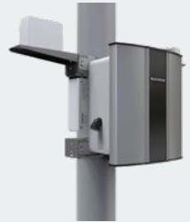
Weathercom ® Automatic Weather Station