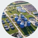
Waste Water Treatment