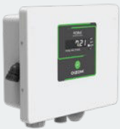
AQBot ™ Industrial Grade Single Parameter Air Quality Monitor