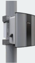
Dustroid ® Ambient Dust Monitor