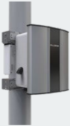
Polludrone ® Ambient Air Quality Monitor