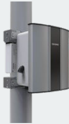
Odosense ® Odour Monitoring Equipment