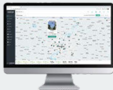
Envizom ™ Web based air monitoring software for remote data access