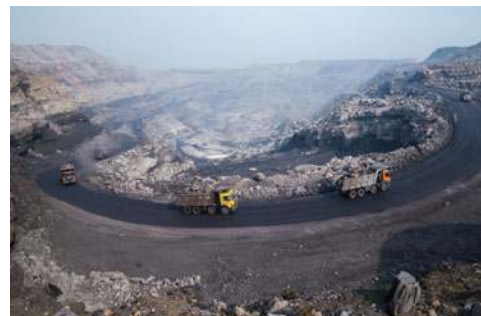
Mining And Quarrying