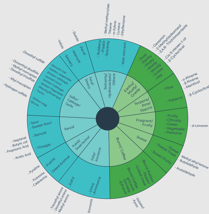
Fig 1 Descriptor wheel for a few odorous compounds

Odor character, also known as odor quality refers to the specific and distinctive qualities or attributes that make up the overall smell or scent of a substance or object [5]. It describes the subjective perception of the odor and is often used to describe and differentiate various smells. Odor character can be influenced by a combination of chemical compounds and sensory receptors in our olfactory system.