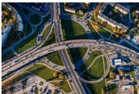
Roads And Highways