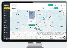
Envizom ™ Web based Environmental Software