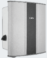
Polludrone ® Ambient Air Quality Monitor