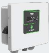
AQBot ™ Industrial Grade Single Parameter Air Quality Monitor