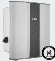
Dustroid ® Ambient Dust Monitor