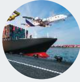
Airports / Seaports