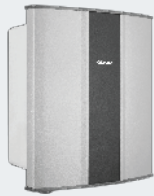
Odosense ® Odour Monitoring Solutions