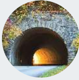
Road Safety / Tunnels